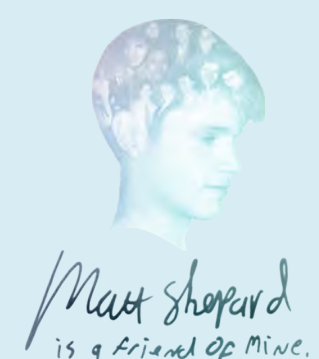
Wednesday, April 8 7 pm, the Spa

Film Appreciation Troupe Presents: React to Film