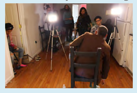
DS 251D 001 Nicky Tavares MW 9:00am-12:05pm, 4 credits